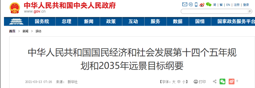
14e Five year plan, English translation on CSET website